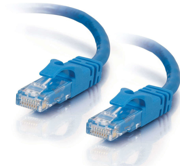
Figure 1. Low-cost CAT6A Cabling

*Source: Internet Price from CDW.COM for OEM-branded/supported products.