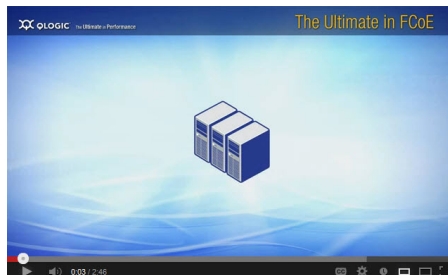
The Ultimate in FCoE

Click on the video link to see why QLogic adapters are the ultimate in FCoE.