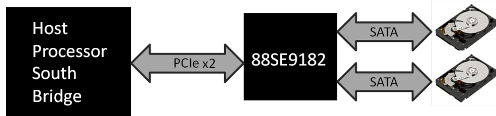
Fig 2. Typical Two Disk Application Example of 88SE9182

The small footprint of the device and the very few required external components occupy a minimal amount of board space, easing system design and reducing cost. The devices are available with optional industrial and automotive temperature grade certification opening up a broad range of applications requiring flexible storage solutions in harsh environments.