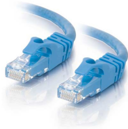
Figure 1. Low-cost CAT6A Cabling