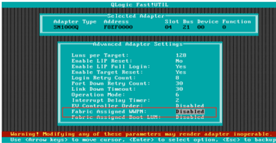
Figure 4-3. Fast!UTIL: Fabric Assigned WWPN